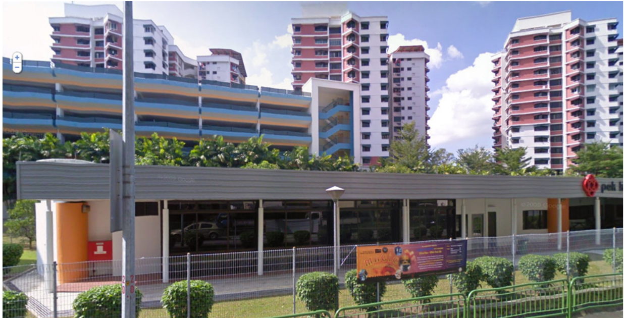
Tower blocks –view from distance (No. 37, 38 and 39 from right to left)