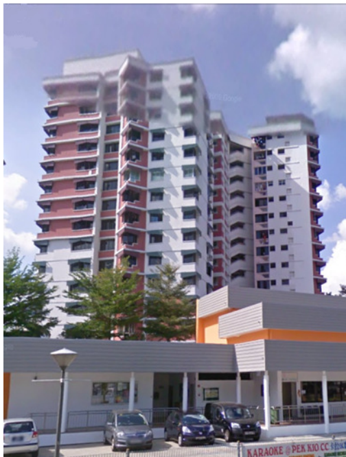
Full view of Tower Block 37